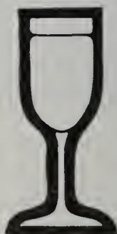
5 oz. wine